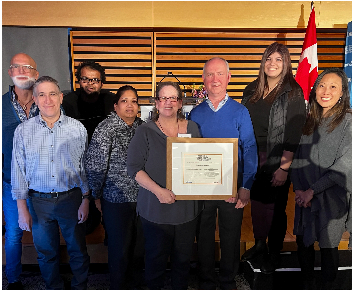
Silent Voice was honoured to receive a prestigious City of Toronto Community Champion Award