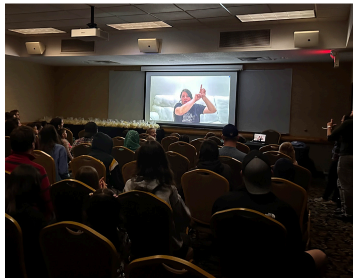
Staff engaged in Indigenous signed languages education

Our settlement program expanded to manage the large influx of Deaf refugees from Ukraine. Silent Voice