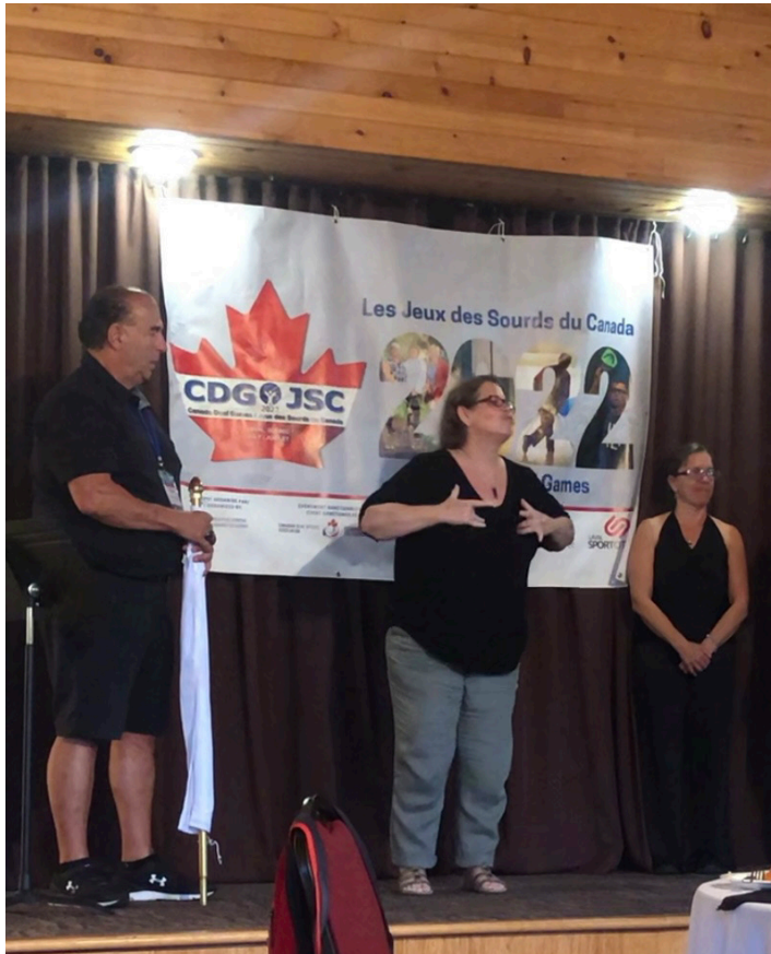
Silent Voice is thrilled to host CDG 2024!

As stakeholders, you can expect to be invited to contribute your thoughts to the next Silent Voice strategic plan.